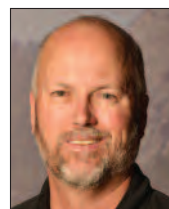
Bart Emery Coors Events Center